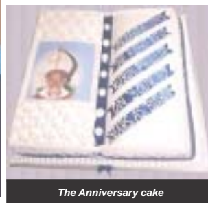
The Anniversary cake