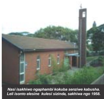
Nasi isakhiwo ngaphambi kokuba senziwe kabusha. Leli isonto elesine kulesi sizinda, sakhiwa ngo 1958.