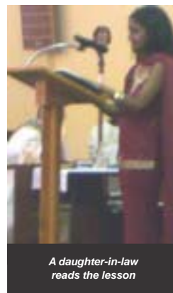
A daughter-in-law reads the lesson