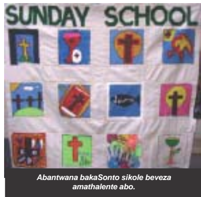
Abantwana bakaSonto sikole beveza amathalente abo.