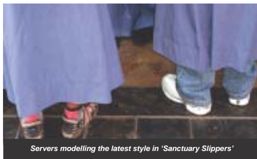
Servers modelling the latest style in 'Sanctuary Slippers'